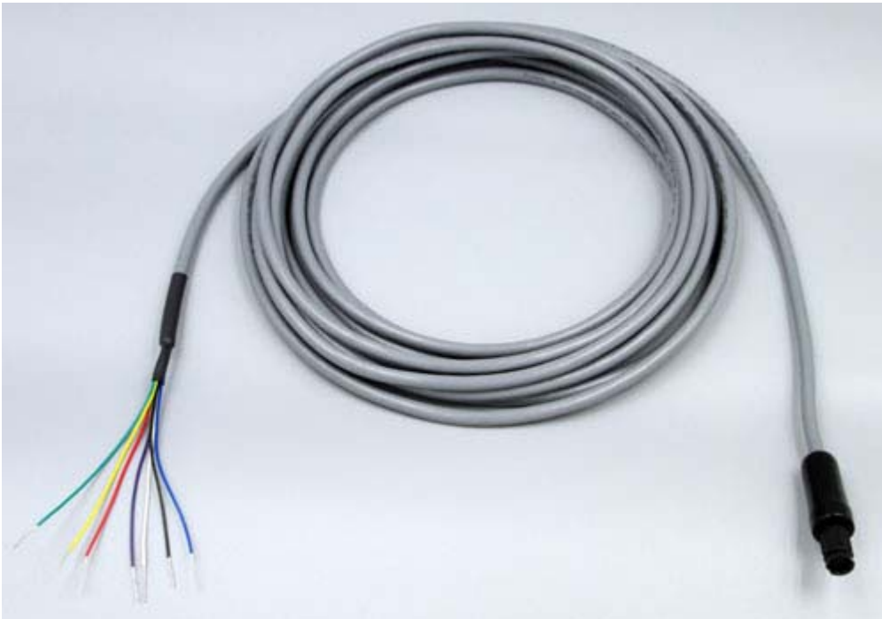
Q7F-Xm-TL Female Q7F snap to tinned leads extension cable