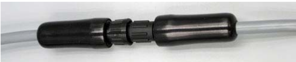
Q7M/Q7F snap connectors are NEMA 6P rated when interfaced.