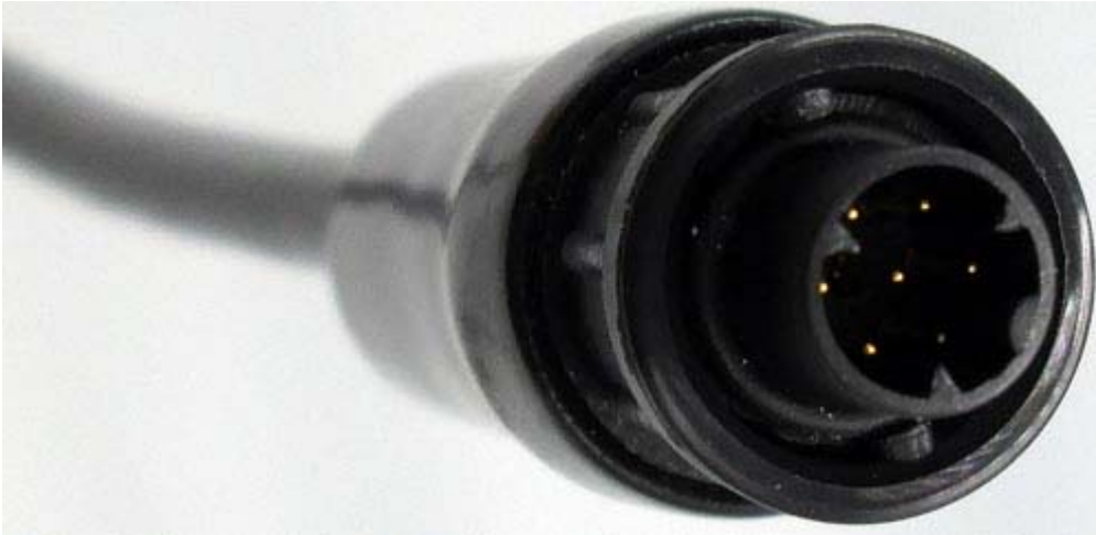
Q7M sensor end of cable snap connector detail close-up view