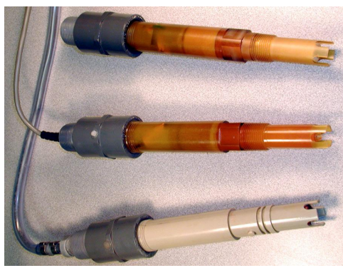
Case Study No. 8 - Total Cyanide Determination in Gold Mining

Rugged pH and Cyanide Ion Selective Mining Sensors for Gold Leach Applications