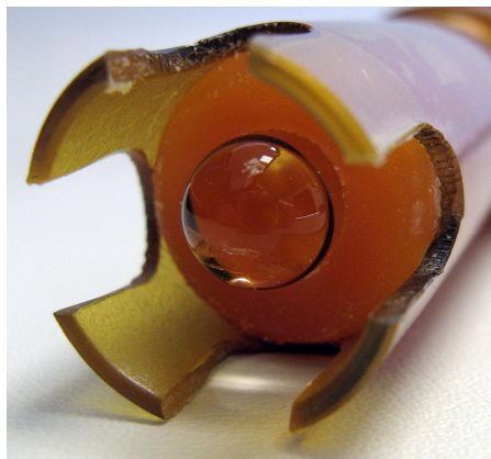
PNHF 6431 pH Sensor