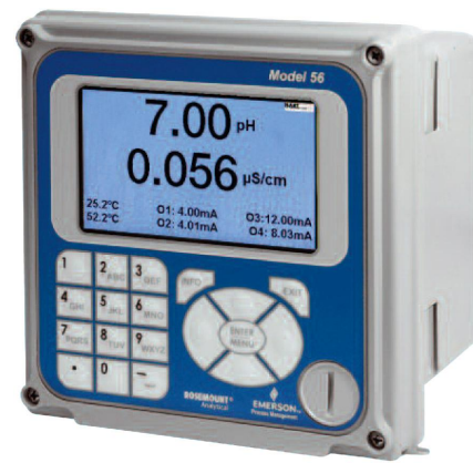
Dual 56 Total Fluoride Analyzer