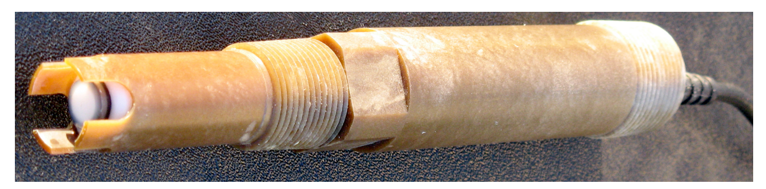
The ion selective sensor shown above is a representative picture for visualization purposes. Your particular sensor may appear somewhat different to that shown above for a variety of reasons

YOU CAN VIEW THE SENSOR SLOPE RESULTING FROM A 2-POINT CALIBRATION WITH PARAMETER P15 AND THE SENSOR OFFSET RESULTING FROM A 2-POINT CALIBRATION WITH PARAMETER P14. IF YOU PERFORM A 1-POINT GRAB SAMPLE OFFSET SUBSEQUENTLY THE OFFSET (P14) WILL CHANGE WHEREAS THE SENSOR SLOPE (P15) WILL REMAIN FROM YOUR 2-POINT SLOPE CALIBRATION.