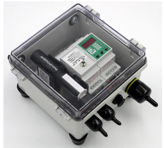
Isometric view with sealing caps installed & lid latched closed for a field ready fully waterproof NEMA 4X rated assembly