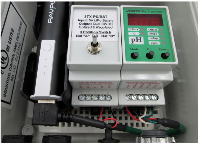
Detail wiring view with for LiPo battery connected to 3TX-PS/BAT