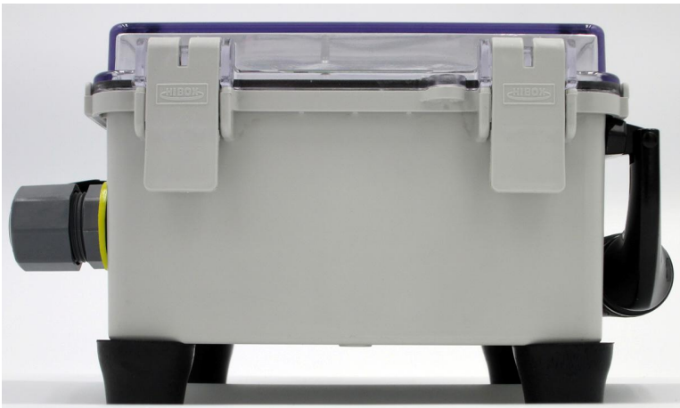
Side latch view showing input ports on left (bottom side) & carrying handle to right (top side) and NEMA 4X sealing latch directly in front (right side)