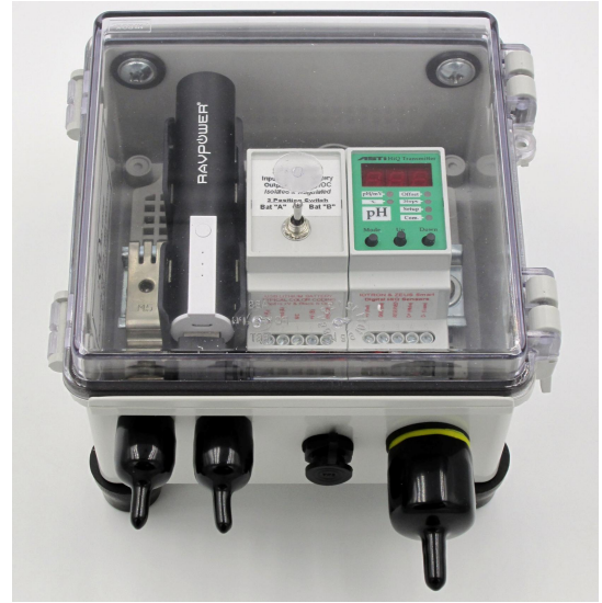
Protective caps installed for 2 each 1/4" MNPT glands & 1 each 1/2" MNPT gland with cover affixed for HiQ snap connector