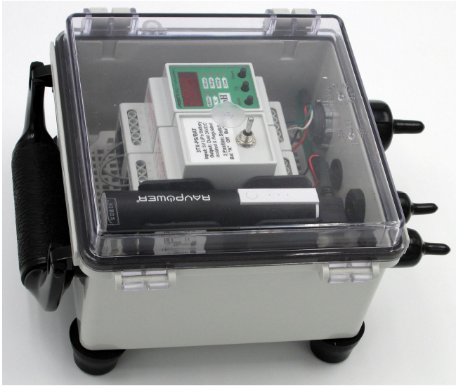
Side view with lid closed showing rugged carrying handle for portability