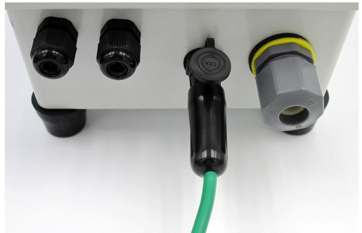
Bottom detail view showing connected HiQ smart digital sensor